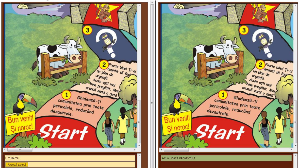
Figure 3. Board game screen shot

The board game data model is implemented in JSON and the interpreting framework in JavaScript. On the server side we use the same implementation as in the dialog framework and its associated chat protocol.